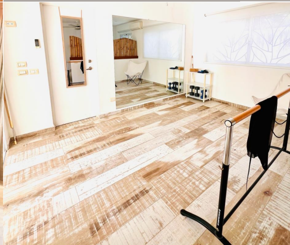
Fitness 20.80 m 2