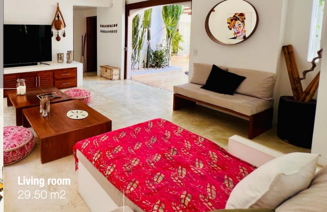
Living room 29.50 m 2