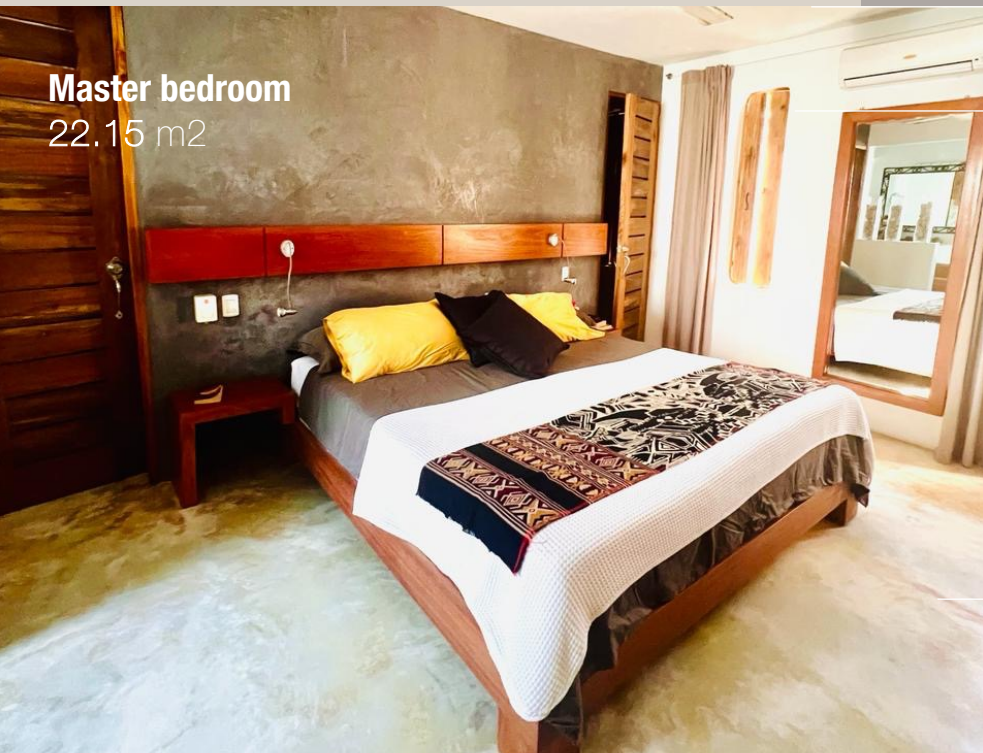
Master bedroom 22.15 m 2