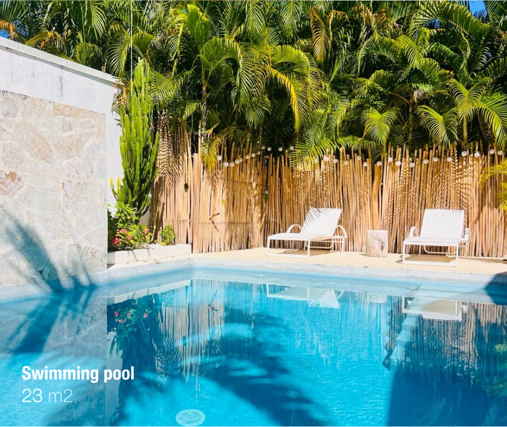
Swimming pool 23 m 2