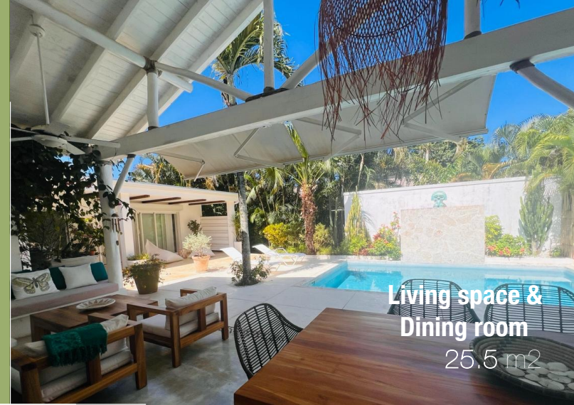
Living space & Dining room 25.5 m 2