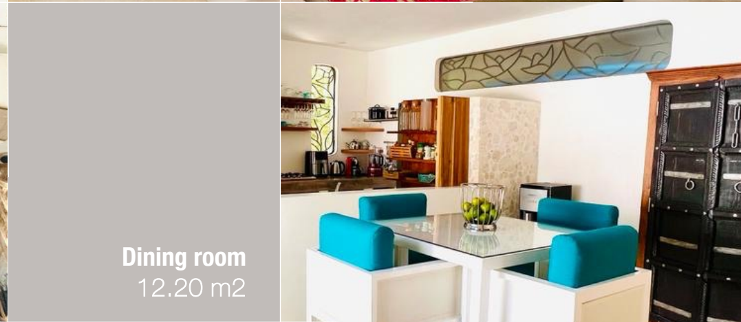
Dining room 12.20 m 2