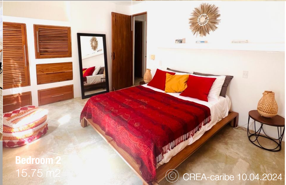
Bedroom 2 15.75 m 2