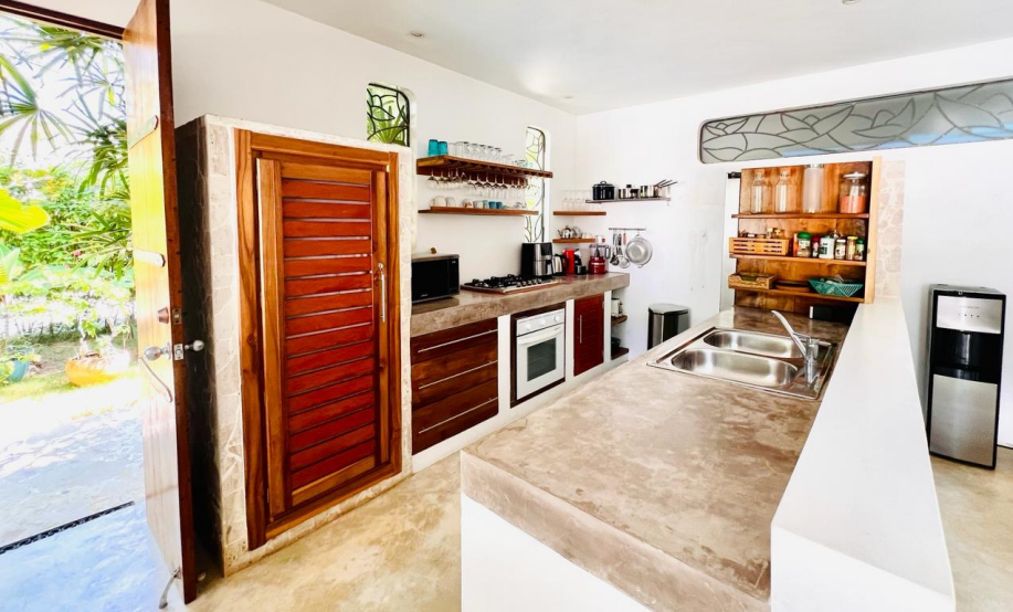
Kitchen 13.20 m 2