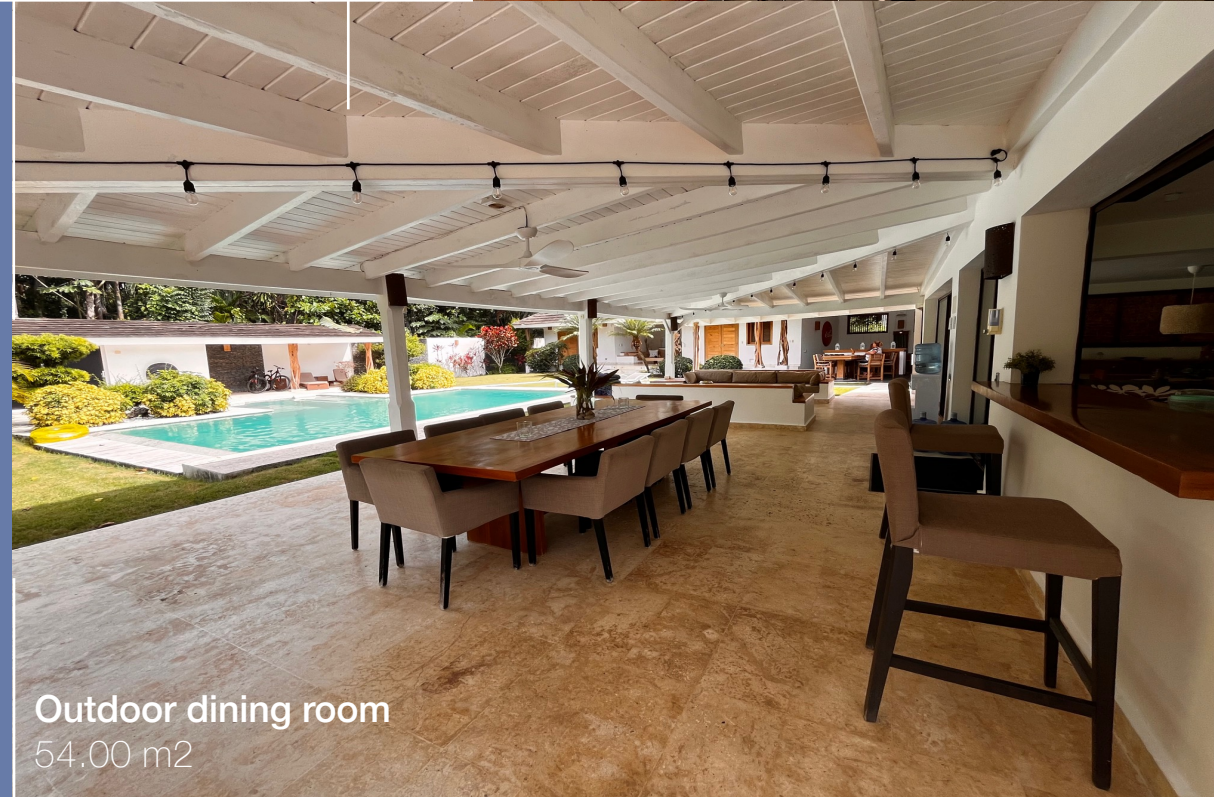
Outdoor dining room 54.00 m 2