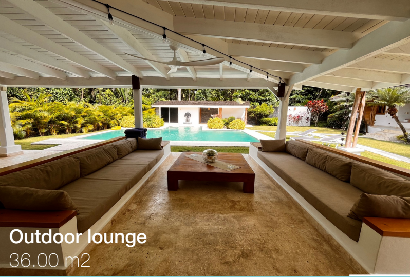
Outdoor lounge 36.00 m 2