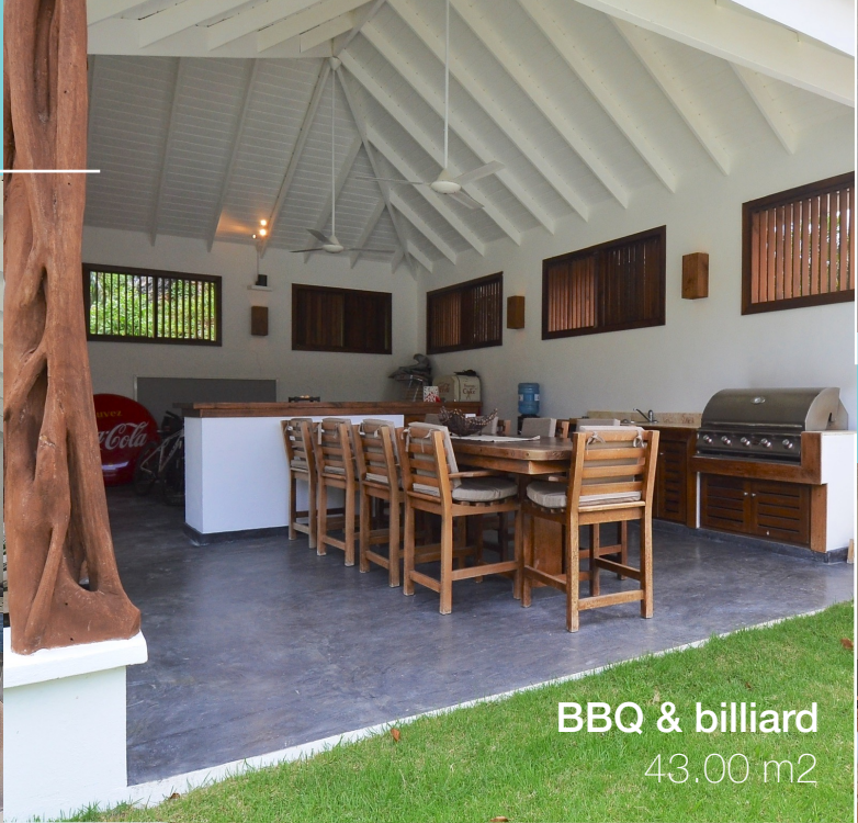
BBQ & billiard 43.00 m2