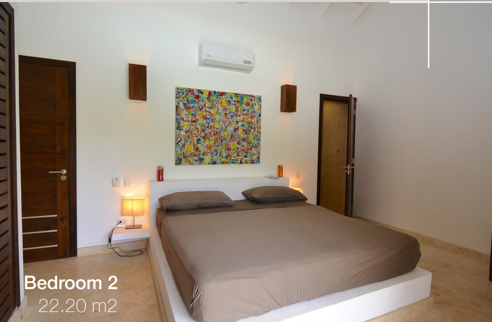
Bedroom 2 22.20 m 2