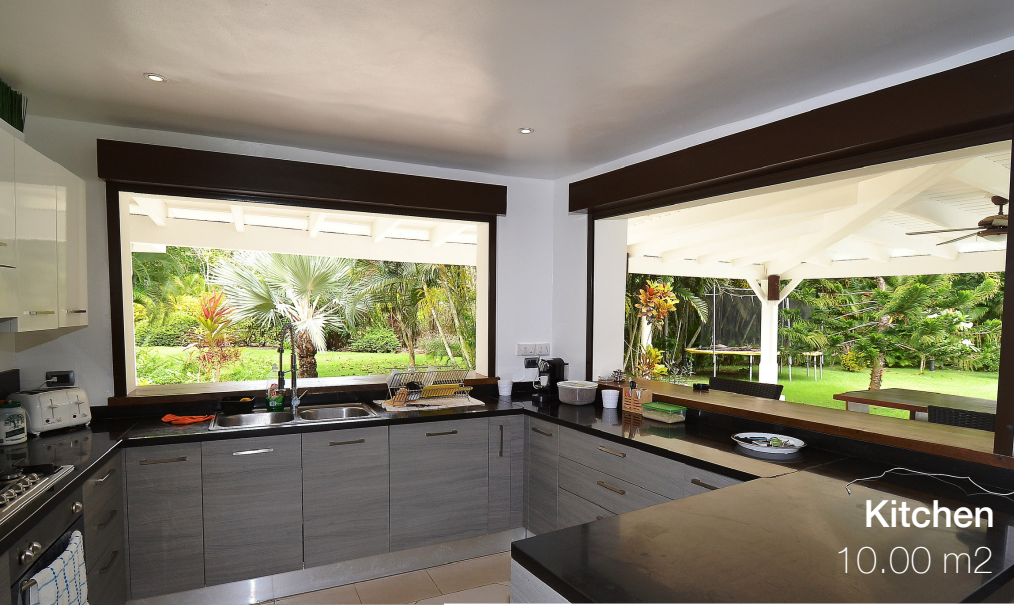
Kitchen 10.00 m 2