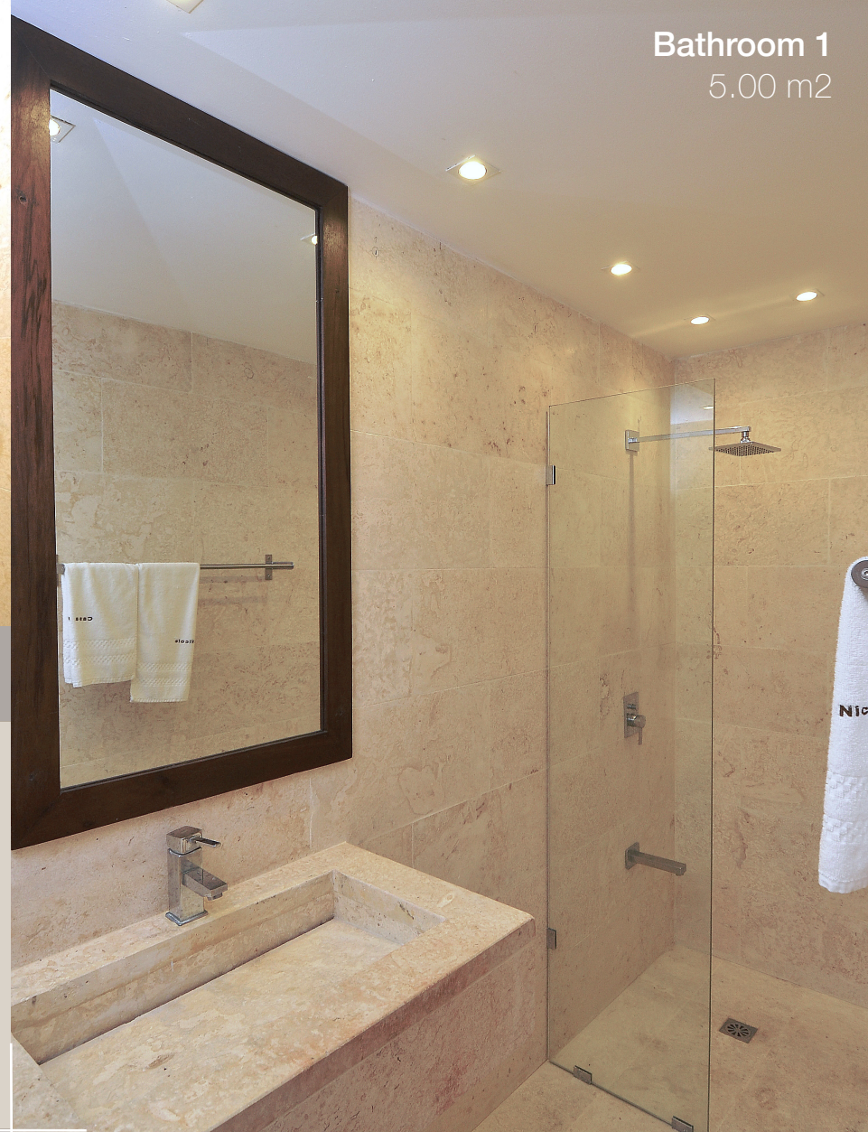
Bathroom 1 5.00 m 2