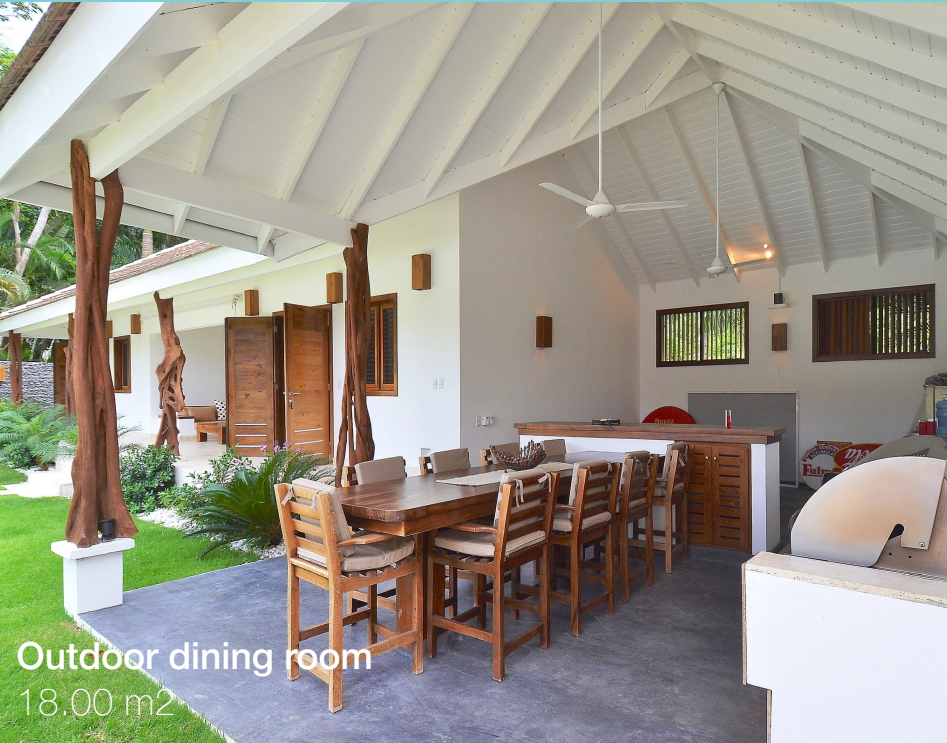
Outdoor dining room 18.00 m2