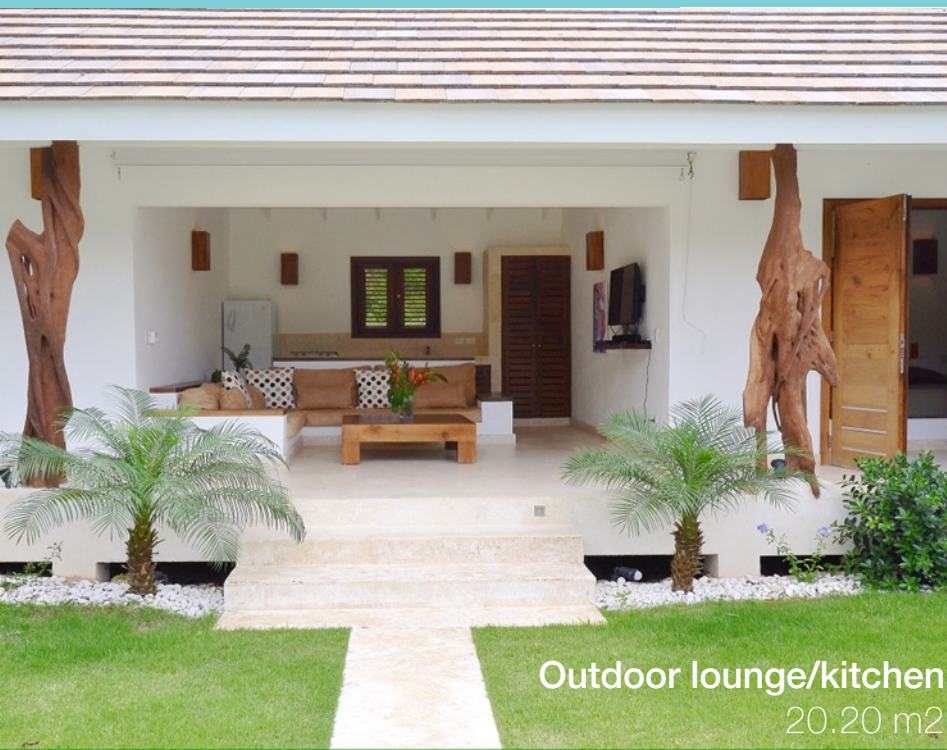
Outdoor lounge/kitchen 20.20 m 2