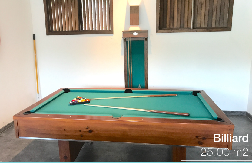
Billiard 25.00 m2