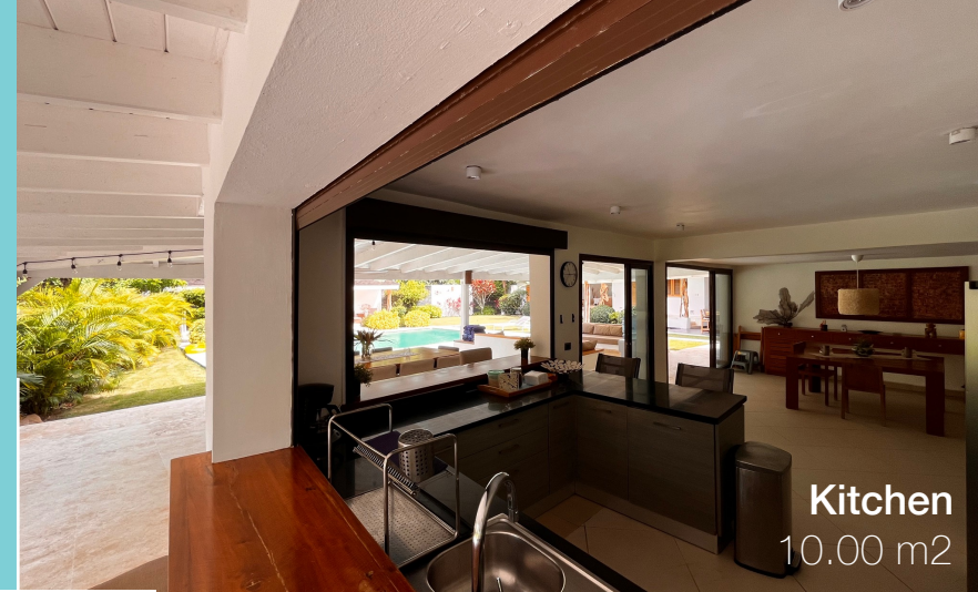
Kitchen 10.00 m 2