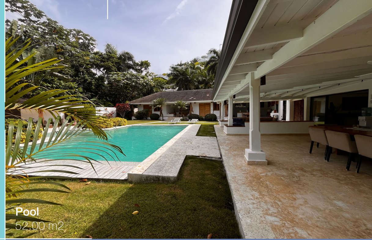
Pool 52.00 m 2