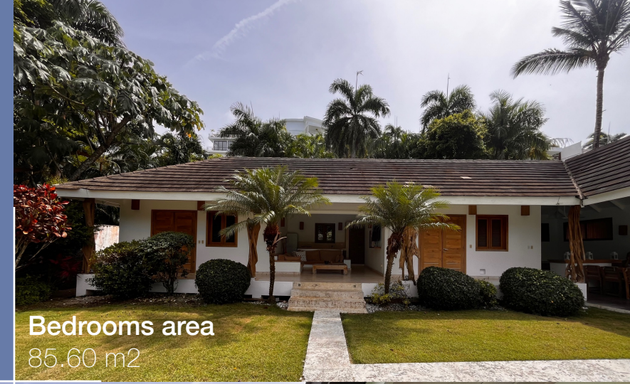
Bedrooms area 85.60 m 2