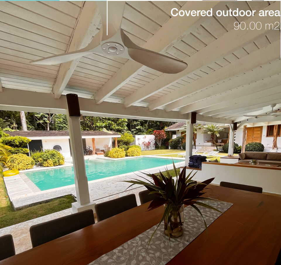
Covered outdoor area 90.00 m 2