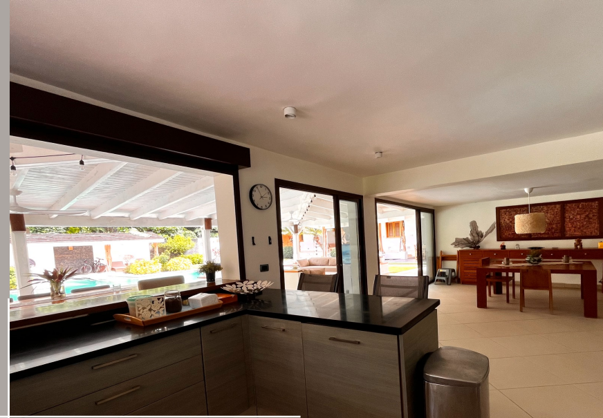
Dining room 30.00 m 2